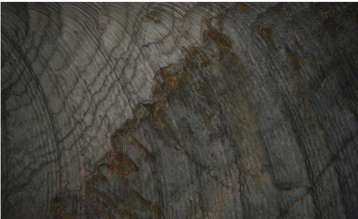
Halite and erosional surface, Realmonte mine