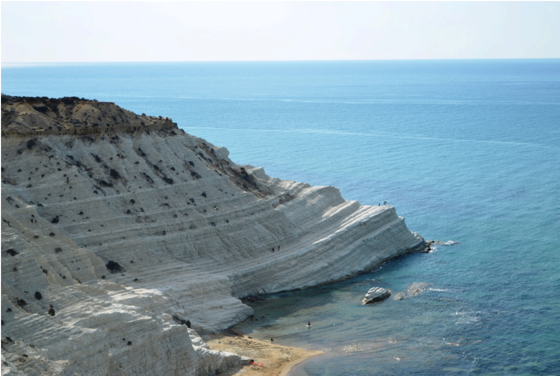
Scala dei Turchi - Zanclean