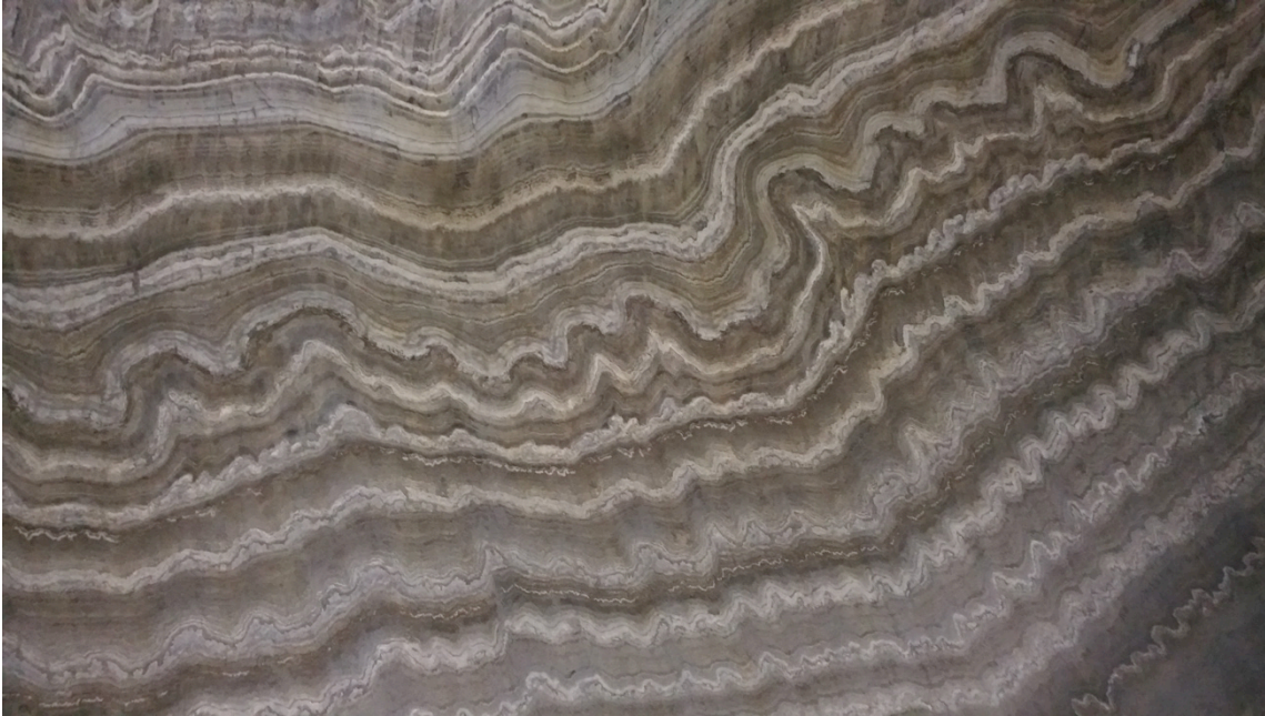
Halite Kainite alternations, Realmonte mine